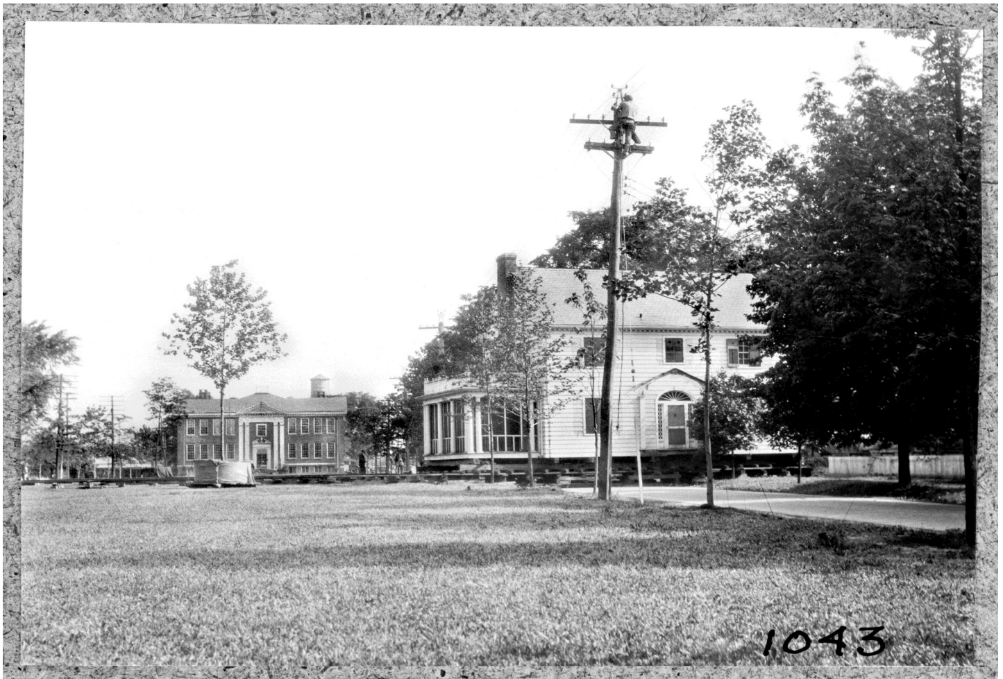
The Bathurst-Peachy House being moved across Palace Green, Williamsburg, Virginia, circa 1930. In the background, the old Williamsburg High School is shown prior to its demolition.