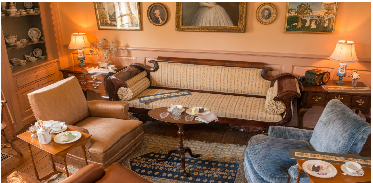
Interpretive installation in Bassett Hall morning room