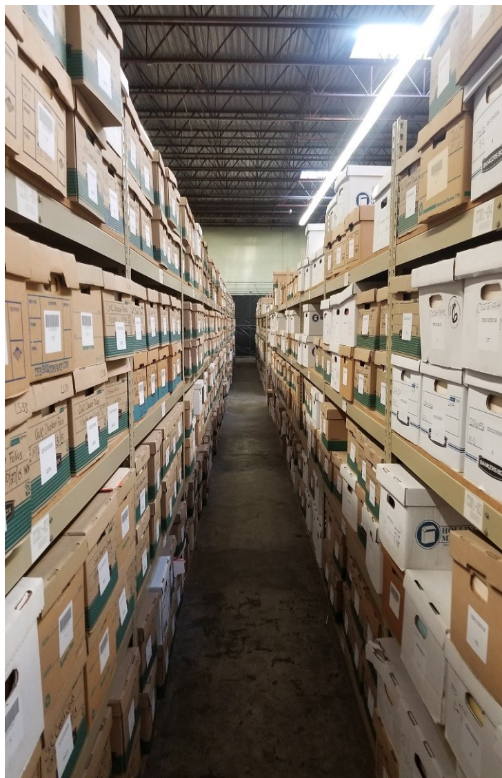
A view down one of the aisles at the Records Center.