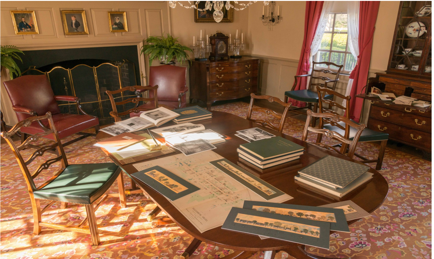
Interpretive installation in Bassett Hall dining room