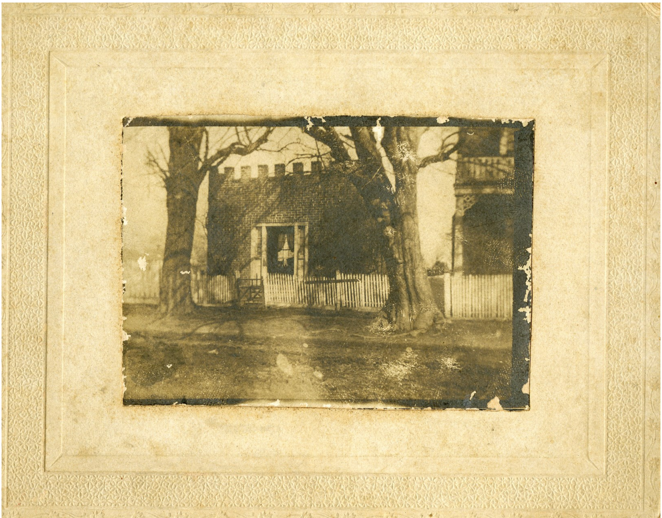
Thomas Everard Office, Williamsburg, Virginia, circa 1904-1905.

The Rockefeller Library is always interested in obtaining photographs, slides, postcards, drawings, and albums relating to Williamsburg to augment its internal visual archives. Please contact us at specoll@cwf.org if you would like to discuss a possible donation.