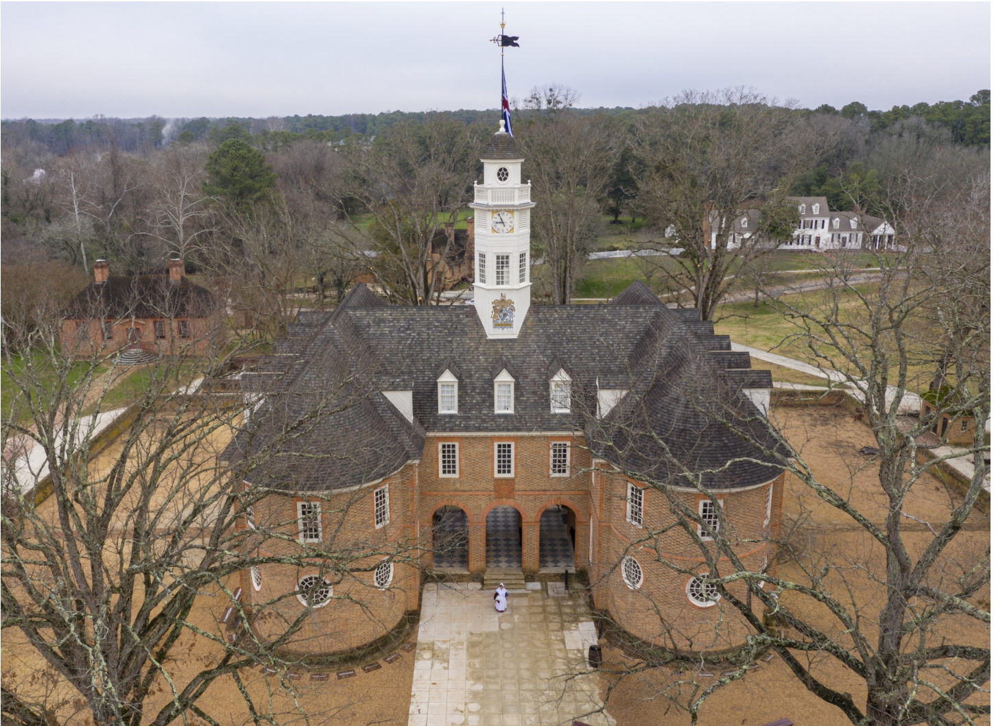
Drone photography of the Capitol's south façade captured by library volunteer Wayne Reynolds.

Last June you may remember that Library volunteer photographer Wayne Reynolds photographed aerial views of the Governor's Palace with his drone. The resulting images were rich in blue sky and green vegetation. What a difference roughly half a year makes! This past January Wayne and I set out with his drone to photograph the Capitol and surrounding grounds. As we all know, weather in January is quite different than the weather in June – especially in Virginia. If there is no snow then there is definitely rain. Lots of rain. We shot the Capitol the day after a cold winter rain had soaked the area. While you can see how wet it is – the winter weather also removed all the leaves from the trees providing us with an unobstructed view of the building itself. Not only were we able to clearly capture all angles of the Capitol but also views west down Duke of Gloucester Street and aerial views of the William Finnie House and surrounding buildings on Francis Street. Wayne also managed to nab a selfie of us with Burke Humphries from the Security and Safety department. Burke is always with us on drone shoots to ensure the safety of guests, employees and buildings while the drone is flying. We're planning on reshooting the Capitol when the leaves begin to bud so we can compare winter with spring. Until then, however, we'll still keep Wayne's drone busy to provide us with even more bird's eye views of the Historic Area.