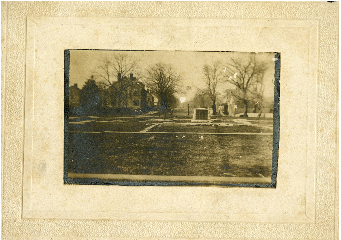
View looking west down Duke of Gloucester Street from the site of the Capitol, Williamsburg, Virginia, circa 1904-1905.