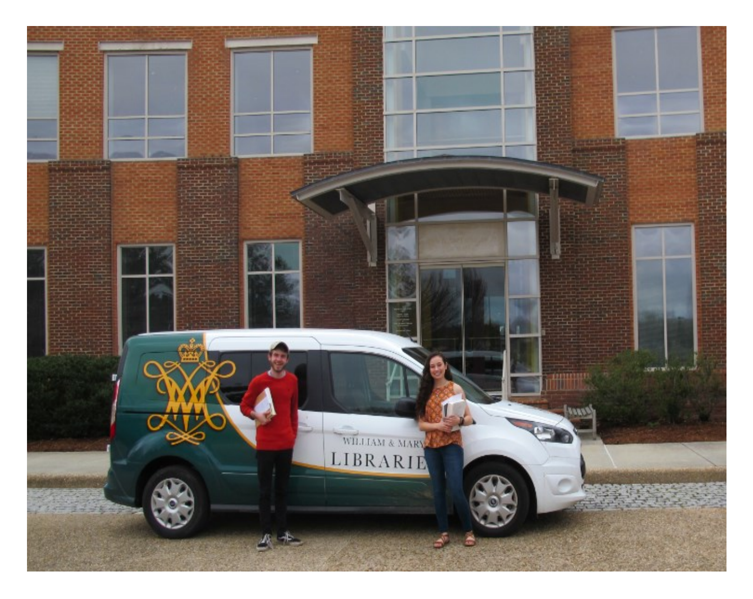
The William & Mary van and student workers on the Rockefeller Library leg of their deliveries.

What's better than access to a world-class library with collections tailored to your research interests? A partnership that provides access to two more excellent library collections! Continuing a tradition of "town and gown" cooperation, Rockefeller Library partners with Swem Library and the Wolf Law Library at William and Mary to form the Williamsburg Research Library Consortium. The participating libraries share an online catalog, so that when researchers look for materials through our website (http:// research.history.org/library), they will also find books held by William & Mary. A "request" function allows Foundation staff to have these materials conveniently delivered to Rockefeller Library. In turn, William & Mary students and faculty may (and often do!) request materials from our specialized collection. A distinctive van staffed by friendly William & Mary student workers makes the rounds between libraries several times a week, ensuring that researchers never have to wait long to get their hands on the books they are yearning for. A win-win for students of Early American history and culture at both institutions!