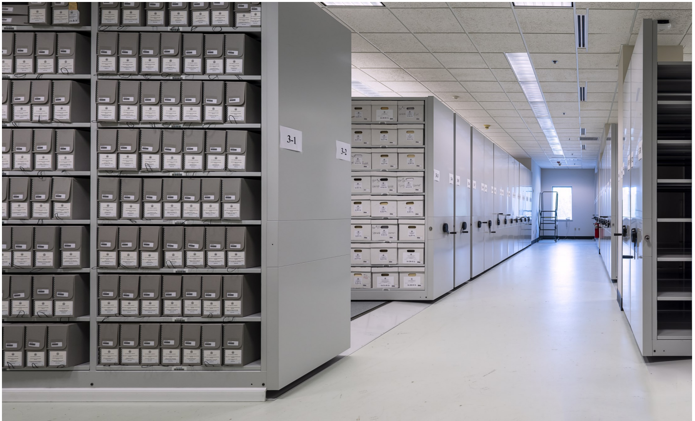
The new Archives Storage Space at the Rockefeller Library, 2018.