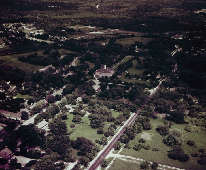
Aerial view of East ends of Duke of Gloucester and Francis Streets with Capitol Landing Road visible in the upper left .