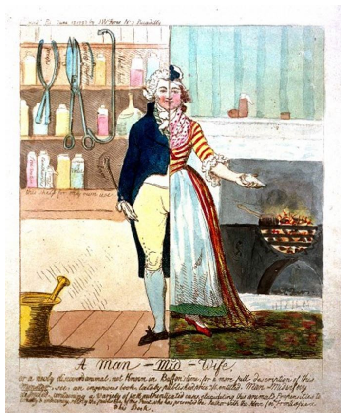
Caricature of a Man Midwife as a split figure, left side female, right side male. From Man-midwifery dissected; or, the obstetric family-instructor. [Illustration]. Defining Gender.

This exciting collection of newly digitized material from the nation's oldest historical society includes Revere Family Papers, 1746-1964; Hancock Family Papers, 1728-1830; Elbridge Gerry Papers, 1744-1895; Pre-Revolutionary Diaries, 1635-1774; French and Indian War Orderly Books; and Revolutionary War Orderly Books. These documents will inform research and programming across the foundation: staff from Military Programs, Historic Trades, and Museums, Preservation and Historic Resources were all enthusiastic about adding it to our holdings.