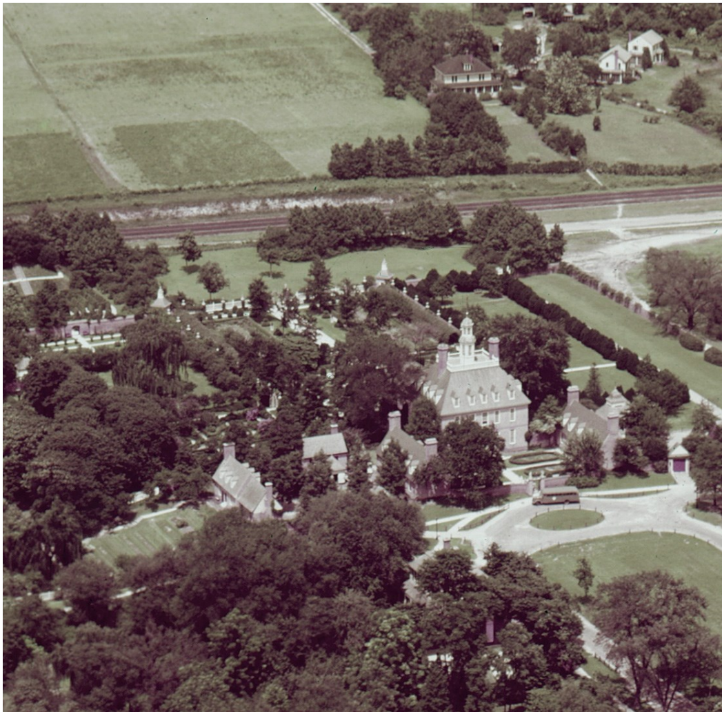
Aerial view of Palace Green area with a military bus parked in front of the Governor's Palace, including Blocks 21, 30-2, 20, 29, 34, and 35.