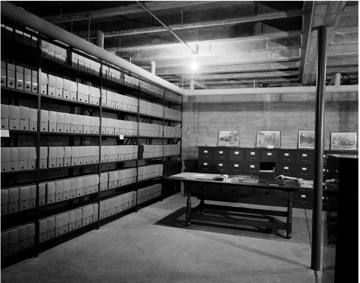
Archives and Records collection storage area in the basement of the Goodwin Office Building, 1948.