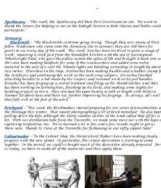
The Mechanick's Adviser