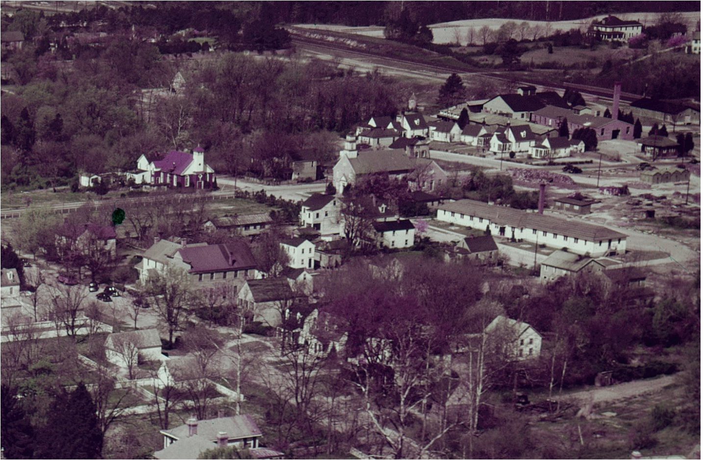
Aerial view of Capitol site and Block 8 looking NW towards Blocks 17 and 27, with African American neighborhood, Samaritan Odd Fellows Hall, employee housing known as "White City." Media Collections.

activities during the era of segregation. The Toby Scott restaurant and store across Botetourt Street from Mount Ararat Baptist Church gave neighbors another place to shop and congregate.