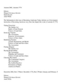
Becoming Americans Today