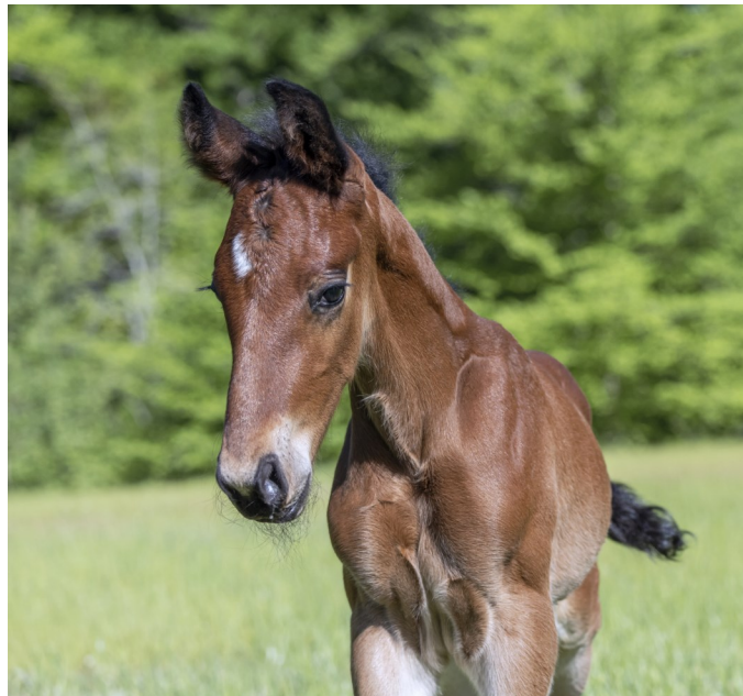
The second new Cleveland Bay foal of 2021: A colt named Williamsburg Windmill Point or Windy.