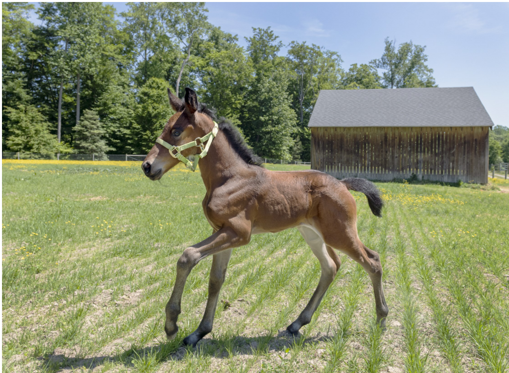
The third new Cleveland Bay foal of 2021: A filly named Williamsburg First Lady, or Lady.

Media Collections not only preserves media from the past but also visually documents the institutional history of The Colonial Williamsburg Foundation for the future. And these new additions are no exception. They are also not finished! Coach & Livestock is expecting more foals soon. Volunteer photographer Wayne Reynolds has been photographing the newbies for us and we include a few here for your enjoyment. These images, plus thousands more, are in our media database called "The Source." The Source is a digital asset management system that serves as the central repository of official Colonial Williamsburg media and accessible by employees and volunteers of the Foundation.