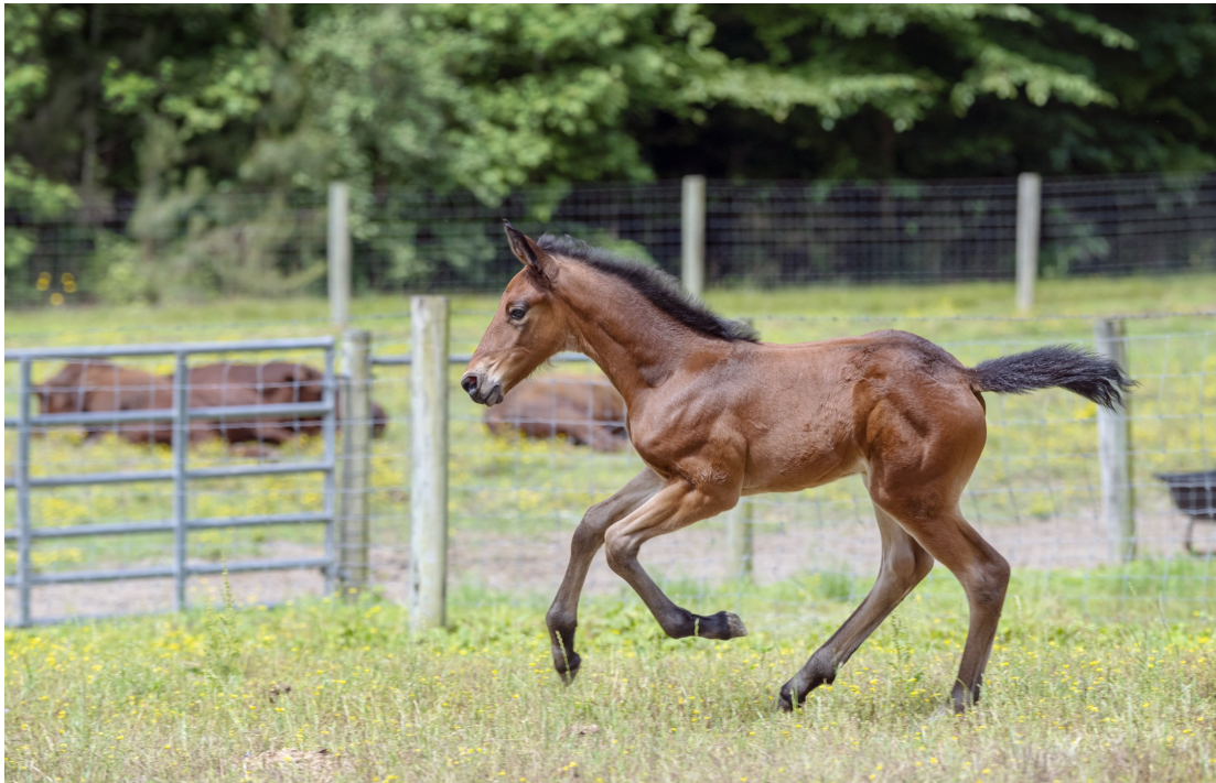
The first Cleveland Bay foal of 2021: A filly named Williamsburg Starlight or Star.