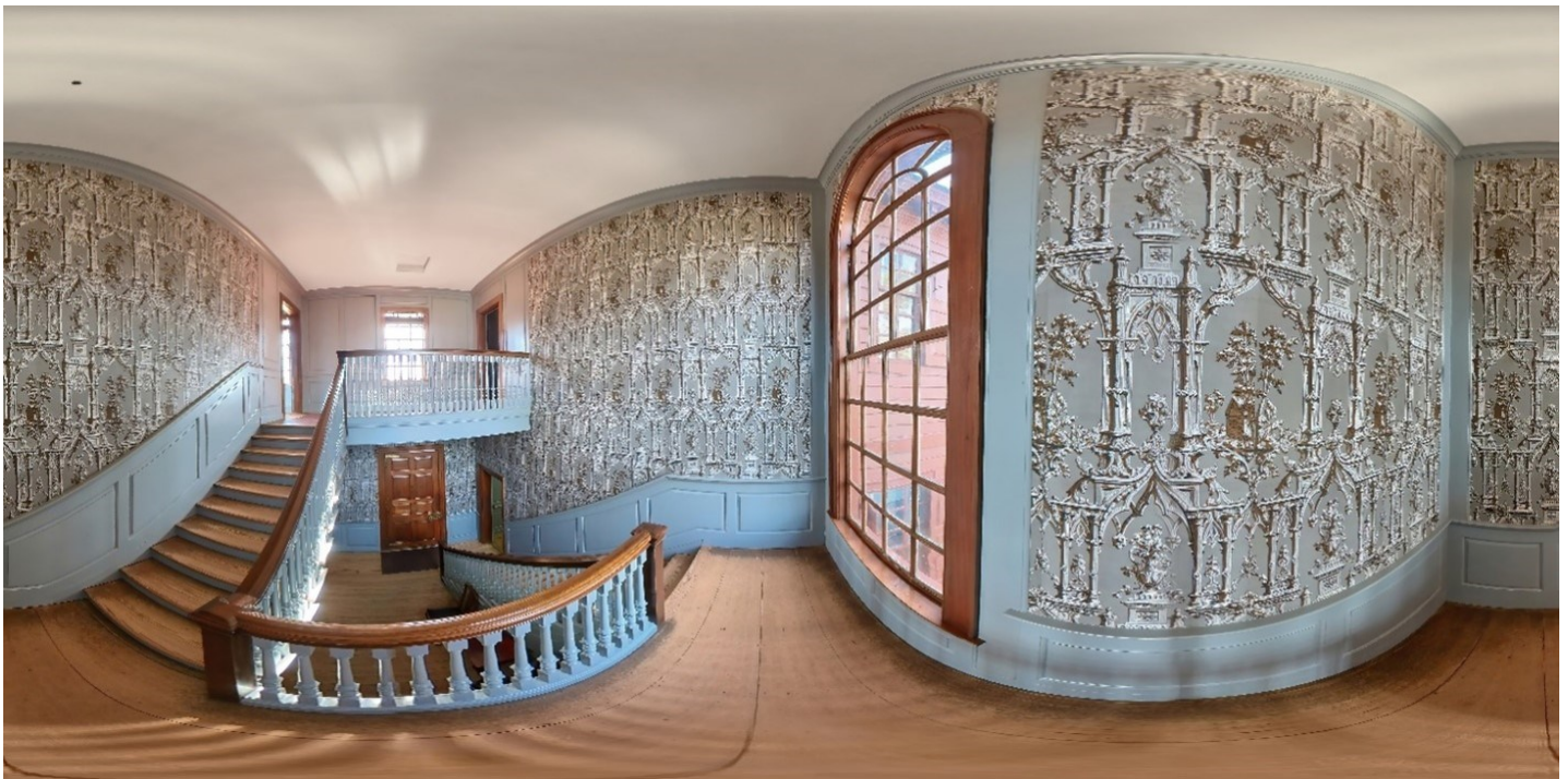
Equirectangular (360°) photo of the Peyton Randolph Hall

If you would like to find out more about this and other 360° tours, go to our blog posts page. It can be found on the CW Blog tab of the Learn menu on Colonial Williamsburg's landing page.