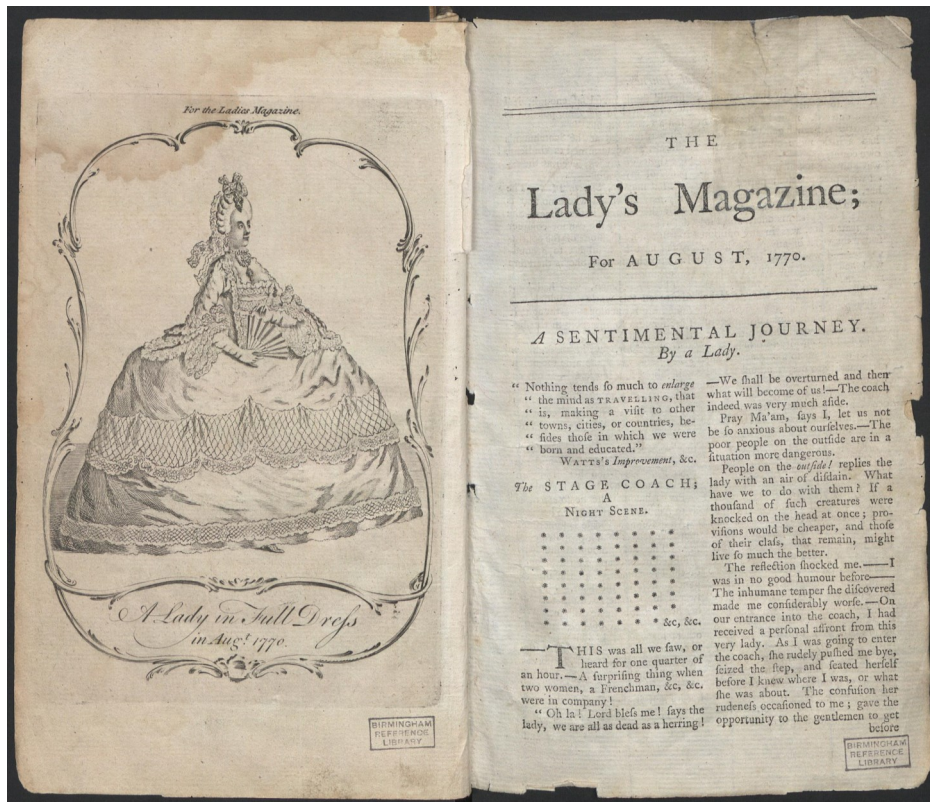
The Lady's Magazine; or entertaining companion for the fair sex, appropriated solely to their use and amusement, Volume 1, August 1770, © Birmingham Central Library.