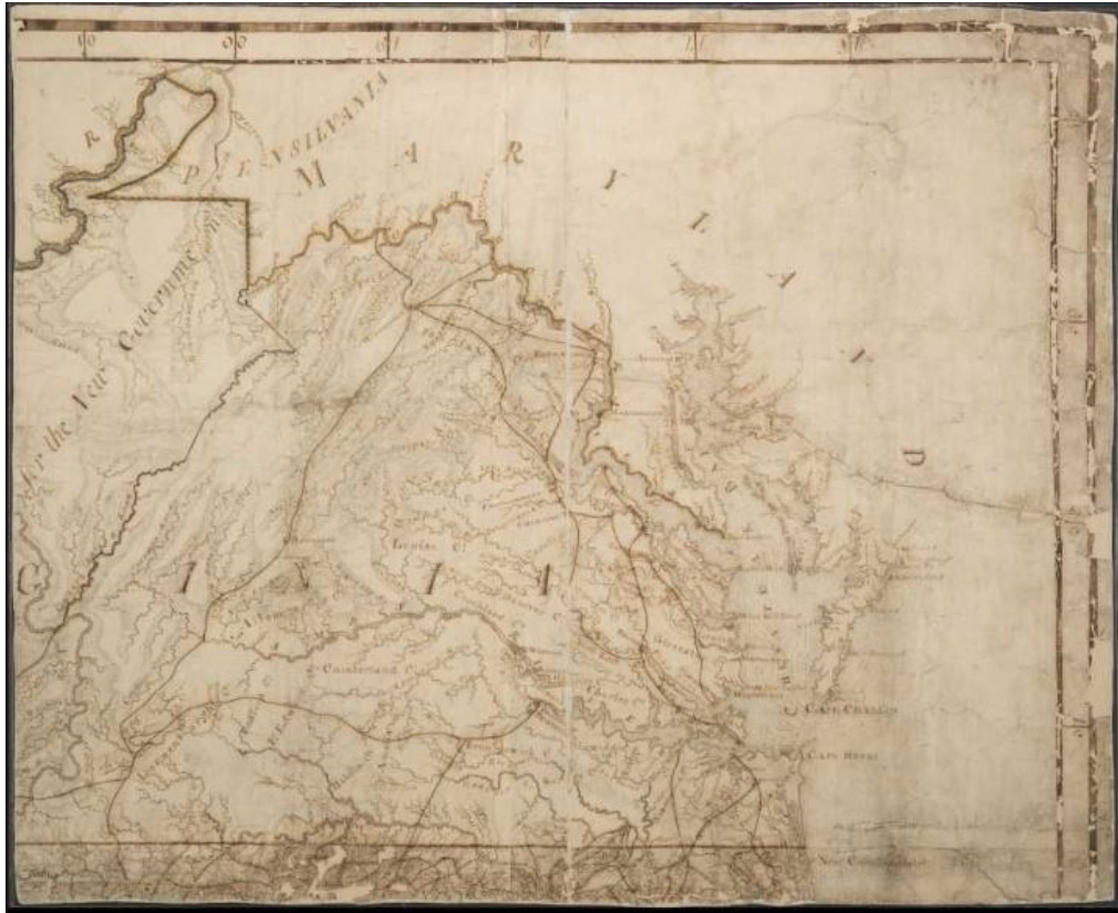
[Part of] A map of the southern Indian district of North America, 1775

Rockefeller Library is thrilled to announce the addition of two new databases to the collection of electronic resources available to Foundation staff and visiting researchers. Our generous Friends of John D. Rockefeller Jr. Library provided funding to help support these purchases and we give them a resounding “Huzzah!” Both these resources will expand our understanding of the eighteenth-century world.