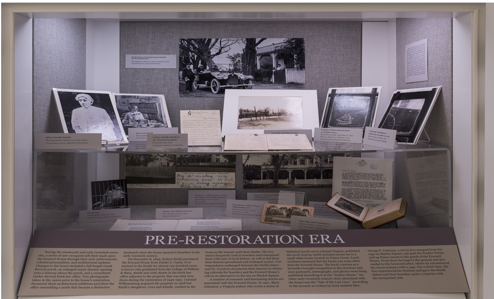
Items documenting the Everard House in the period before it was restored to its 18th-century appearance.